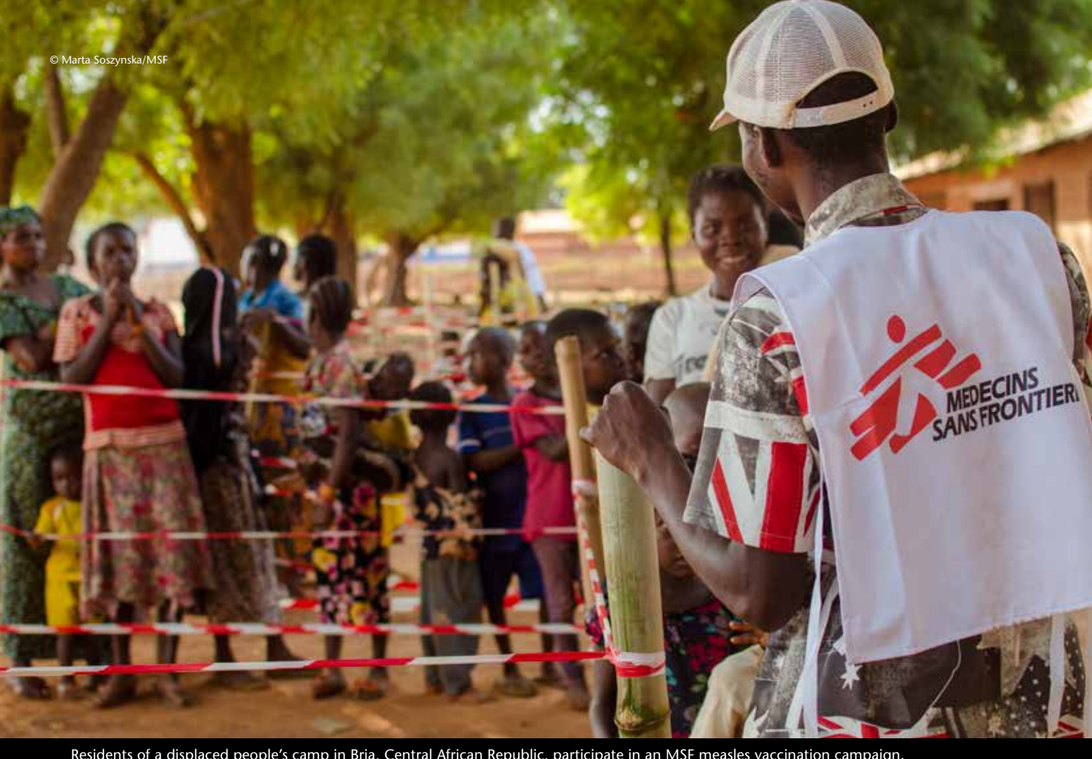
Residents of a displaced people's camp in Bria, Central African Republic, participate in an MSF measles vaccination campaign.