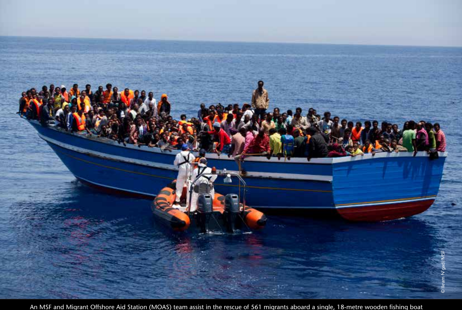
An MSF and Migrant Offshore Aid Station (MOAS) team assist in the rescue of 561 migrants aboard a single, 18-metre wooden fishing boat in distress on the Mediterranean Sea.