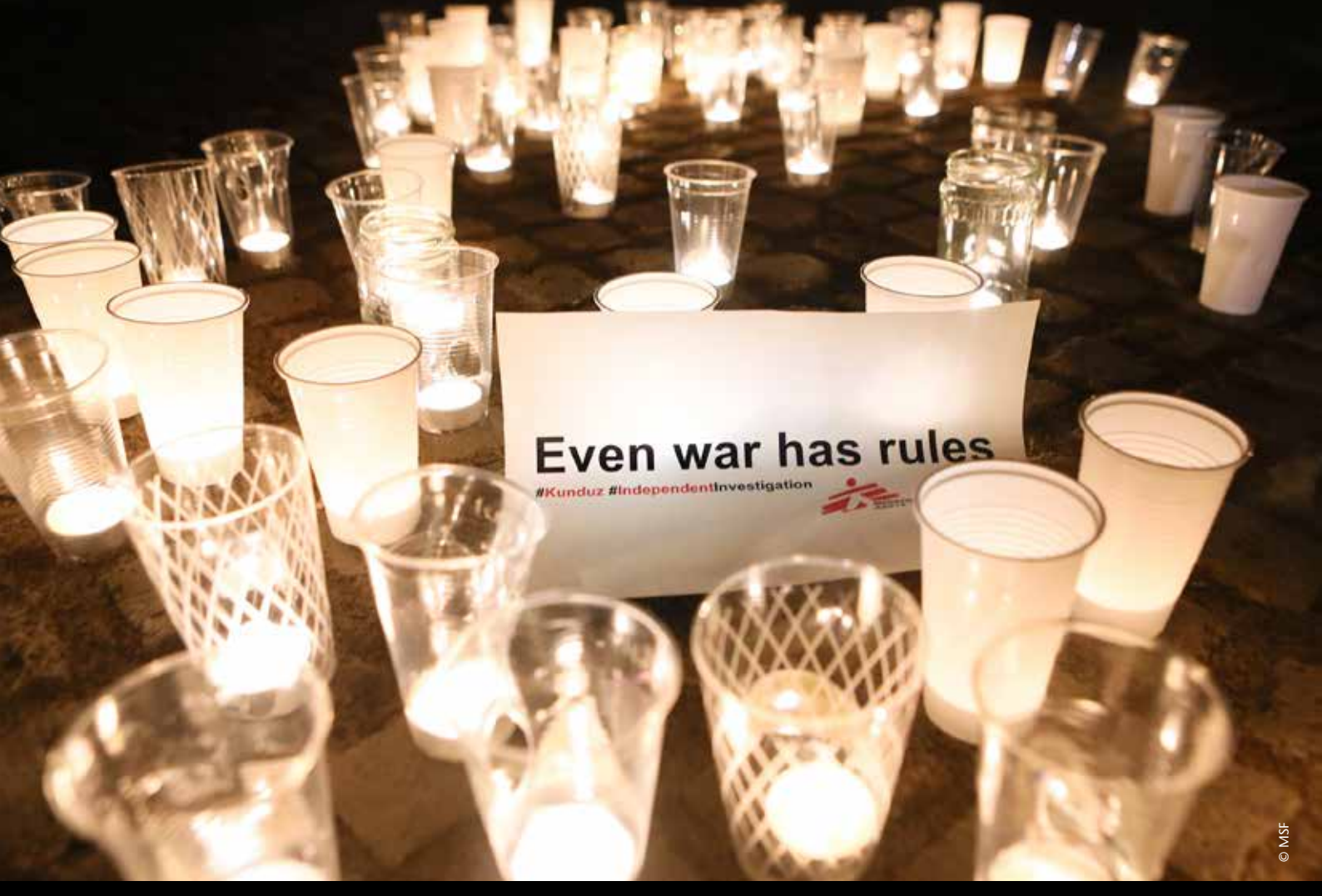
Candles in front of the German Parliament building in Berlin commemorate the one-month anniversary of the attack on MSF's trauma centre in Kunduz, Afghanistan.